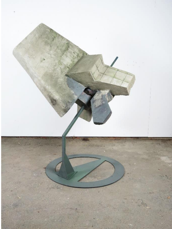
Reactor, 2023, 115 x 100 x 155 cm steel, wood, PU, acrylic resin, cement, paint