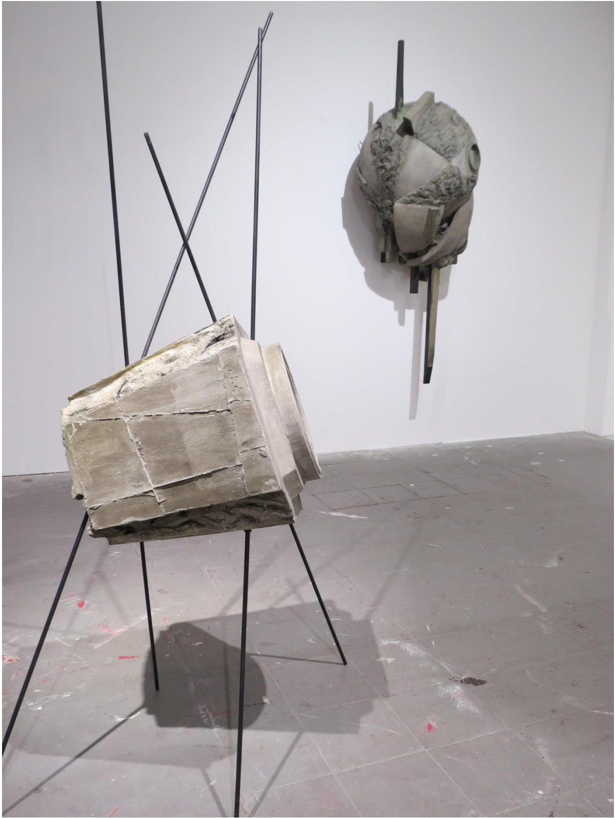
Exhibition view, Keile Contemporary, 2023