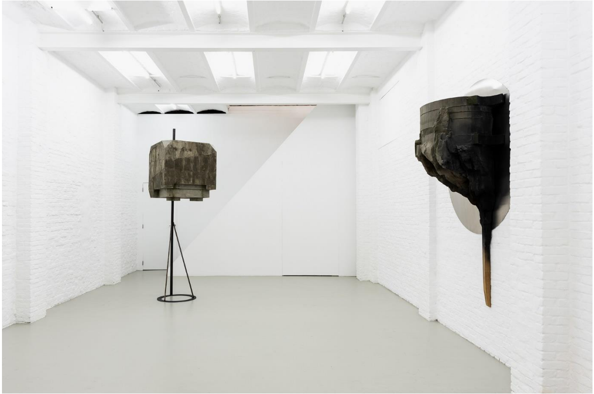
Exhibition view; Capsule, Base-Alpha gallery, 2019