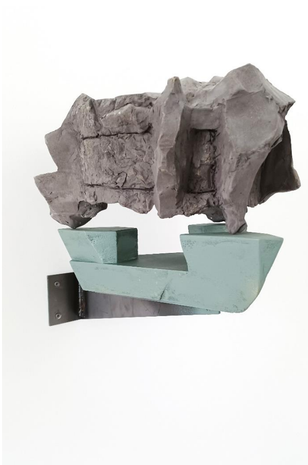
Ego Noise, 2022, 35 x 25 x 35 cm ceramics, wood, steel, paint