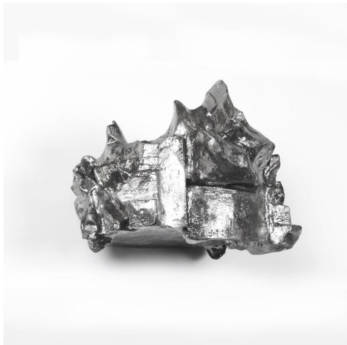
De-formatie 0.2, 2020, 30 x 30 x 25 cm ceramics, glaze, luster