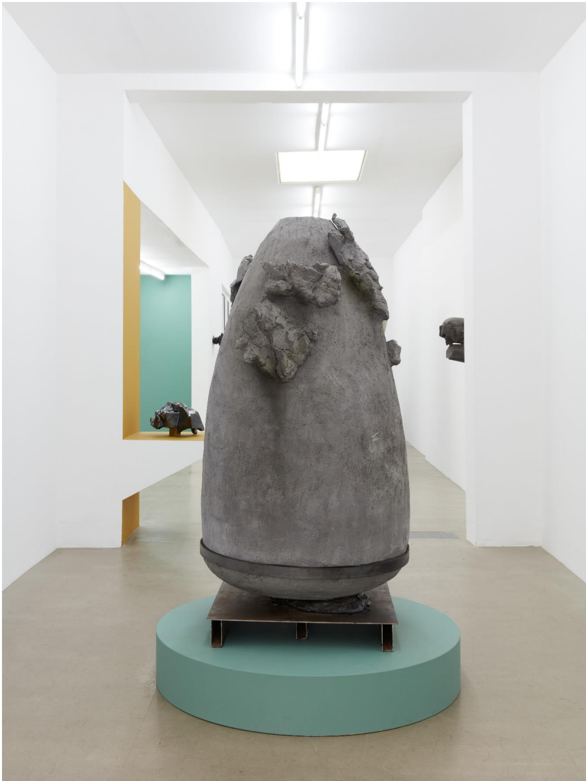
Ezra Stoller Rocks, 2022, 120 x 120 x 200 cm Ceramics, steel, PU