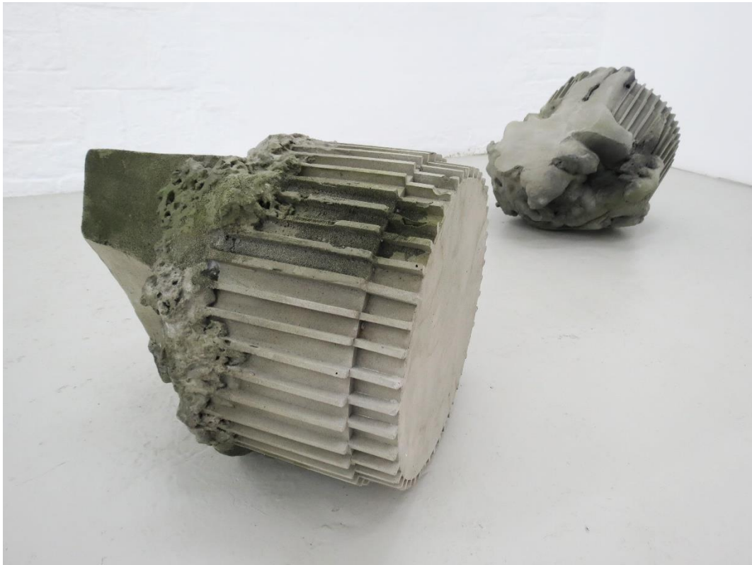
Component 0.1 – 0.5, 2019 Wood, PU, acrylic resin, sponge, cement, paint