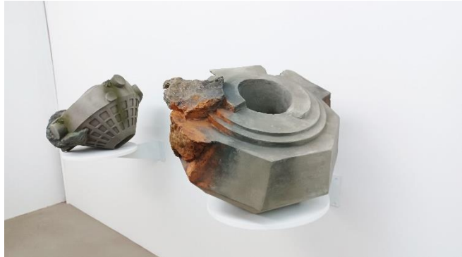
Wild Protoplanet, 2021, 50 x 60 x 55 cm wood, PU, acrylic resin, epoxy, cement, paint