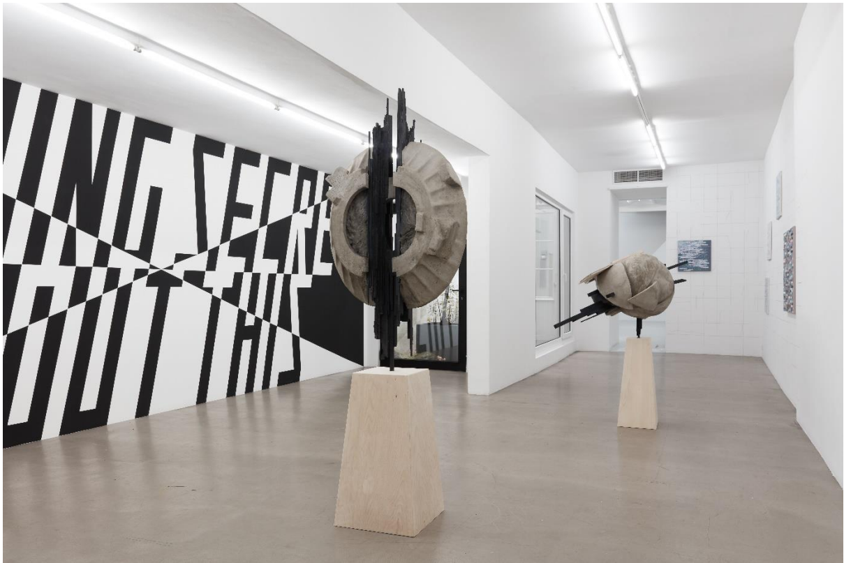
Exhibition view, Base-Alpha gallery; 2023