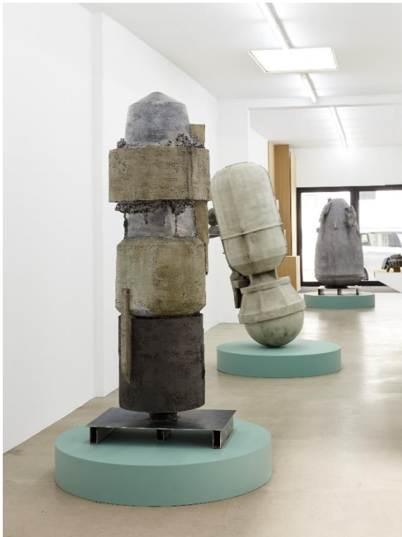
Exhibition view, Base-Alpha gallery, 2022