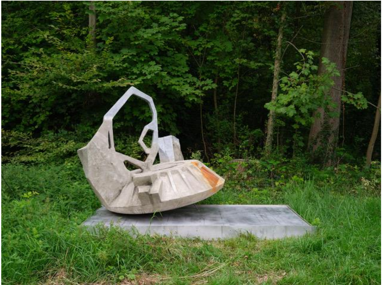
On the Origins, 2023, 175 x 155 x 155 cm steel, EPS, acrylic resin, cement, iron powder, aluminium powder, epoxy