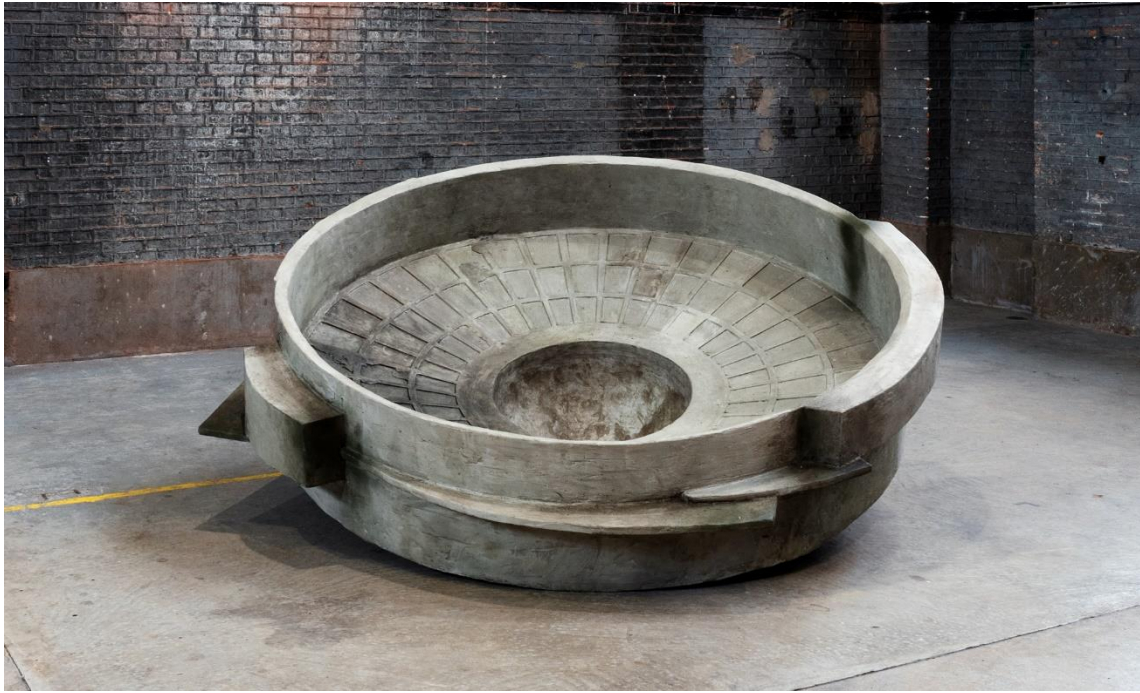
Tower of Silence, 2021, 195 x 195 x 77 cm wood, PU, EPS, acrylic resin, cement, paint