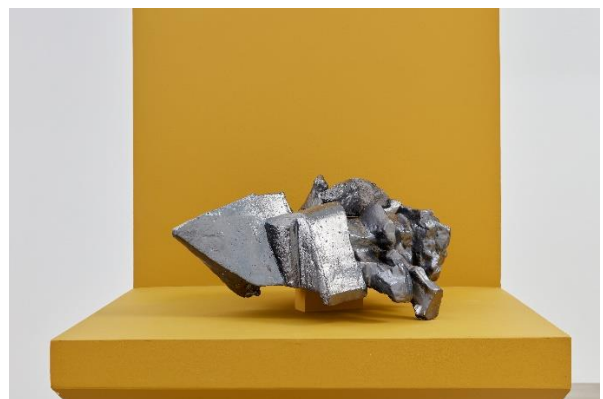
De-formatie 0.3, 2020, 50 x 35 x 20 cm ceramics, glaze, luster