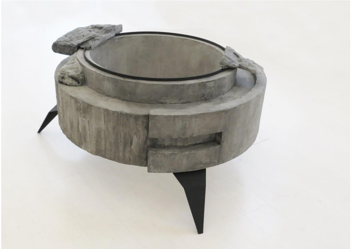
Pano, 2017, 135 x 135 x 60 cm Wood, steel, PU, epoxy, acrylic resin, cement, paint