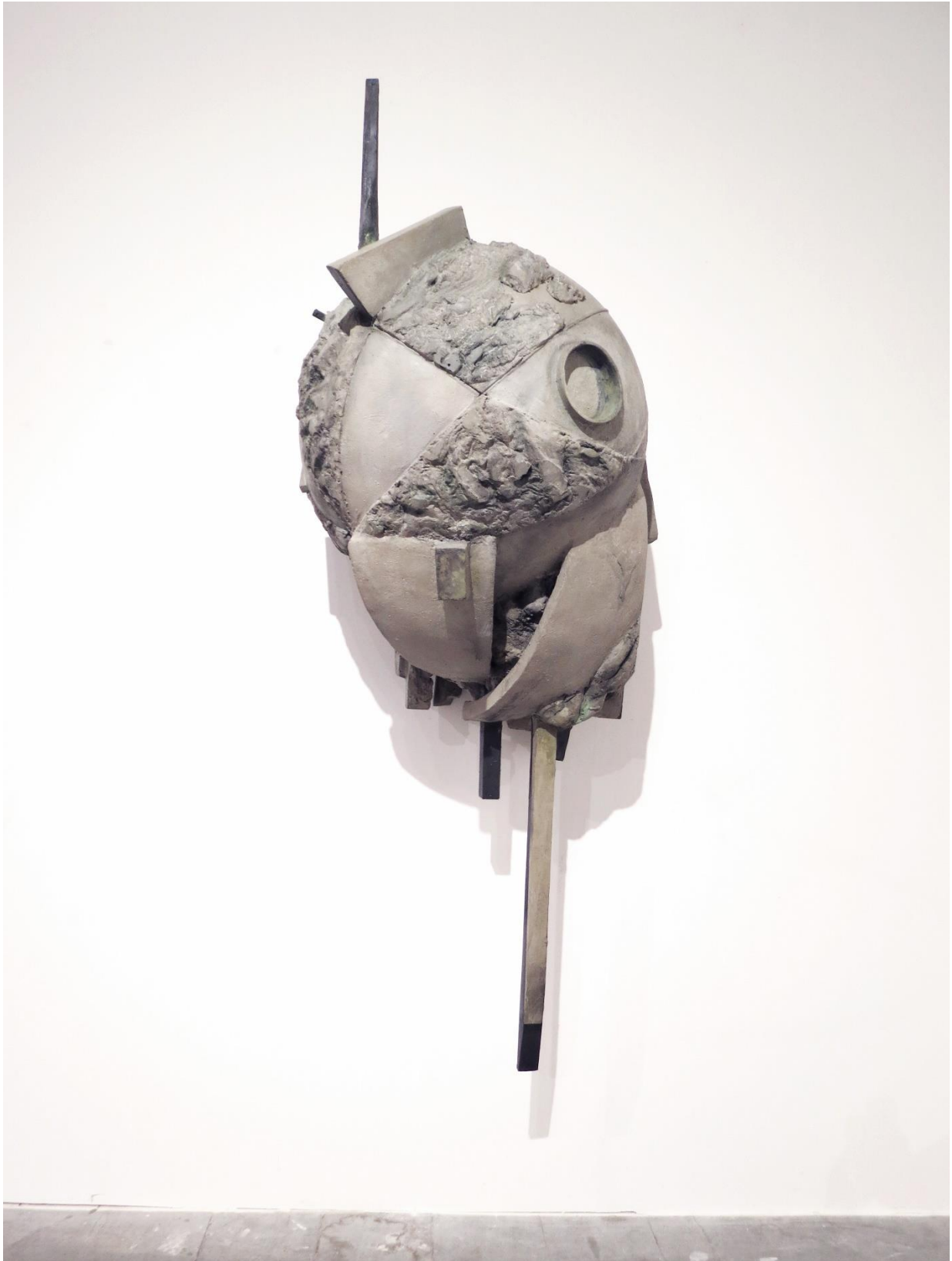
Cluster, 2022, 90 x 90 x 210 cm Wood, steel, EPS, epoxy, acrylic resin, cement, paint