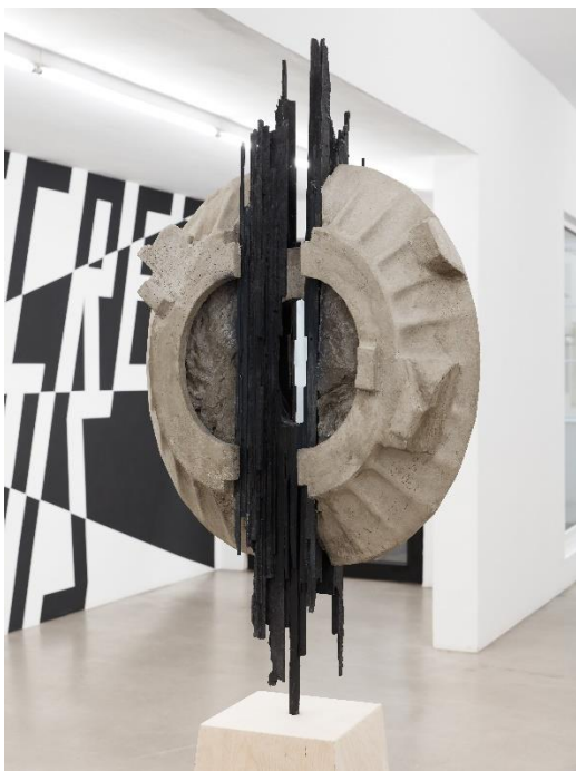
Axis Mundi, 2023, 205 x 75 x 40 cm wood, steel, EPS, acrylic resin, cement, paint