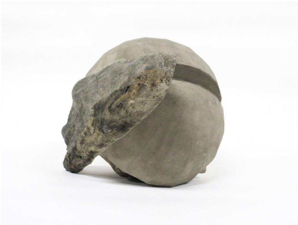
Sfeer 0.2, 2018, 35 x 27 x 25 cm acrylic resin, cement, PU, wood