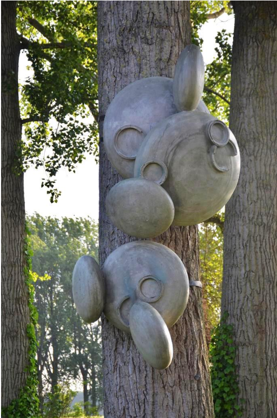
We Fade to Grey, 2021, variable dimensions, steel, acrylic resin, cement, paint, straps