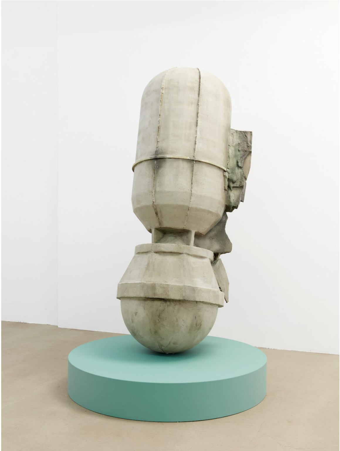
Cosmic Dancer, 2022, 120 x 120 x 200 cm Wood, steel, EPS, PU, acrylic resin, cement, paint