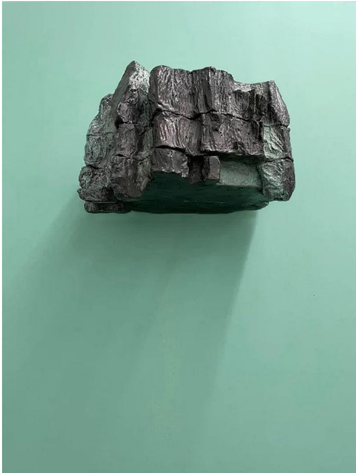
De-formatie 0.1, 2021, 30 x 25 x 20 cm bronze