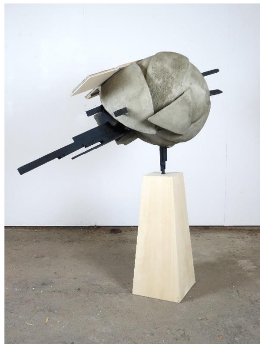
Figure, standing on one point, 2023, 155 x 144 x 60 cm , wood, steel, EPS, acrylic resin, cement, paint