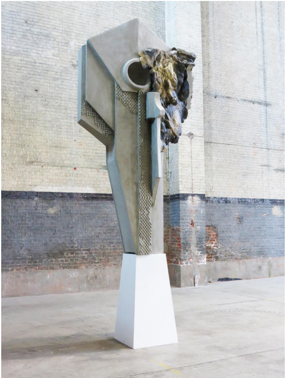
Anachronisme, 2022, 120 x 60 x 220 + 80 ( plint ) cm wood, steel, acrylic resin, PU, epoxy, cement, paint