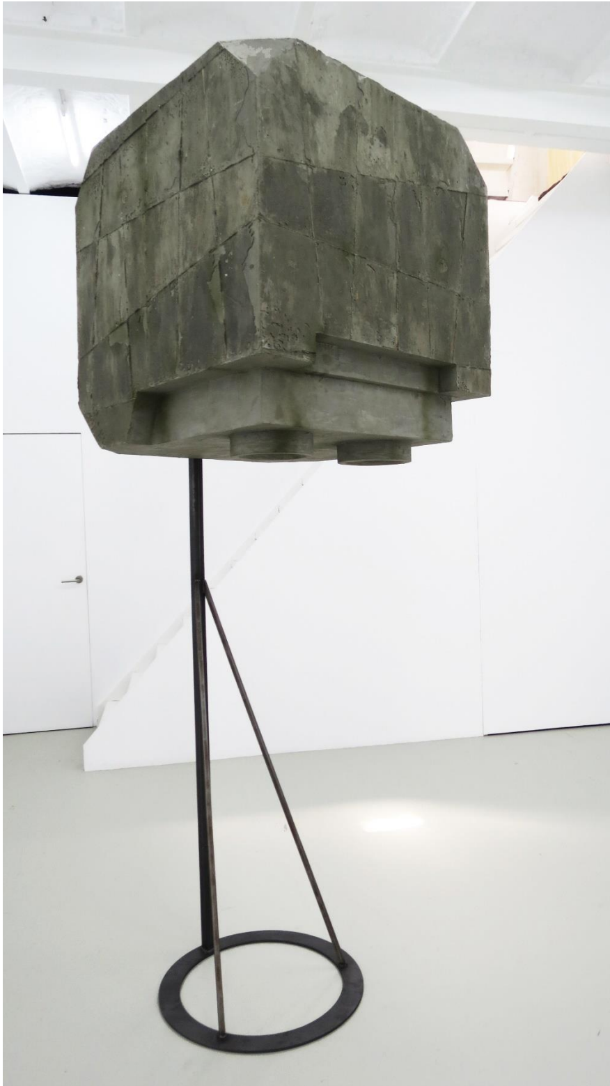
Space Invader, 2019, 85 x 85 X 270 cm Wood, steel, PU, acrylic resin, cement, paint