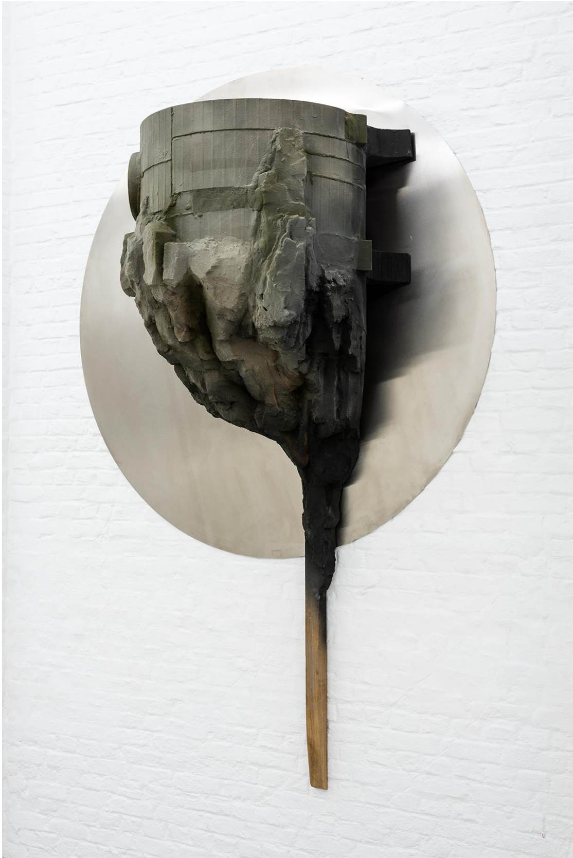
Het Aardmassief, 2019, 120 x 80 X 230 cm, wood, steel, acrylic resin, PU, cement, paint, aluminium