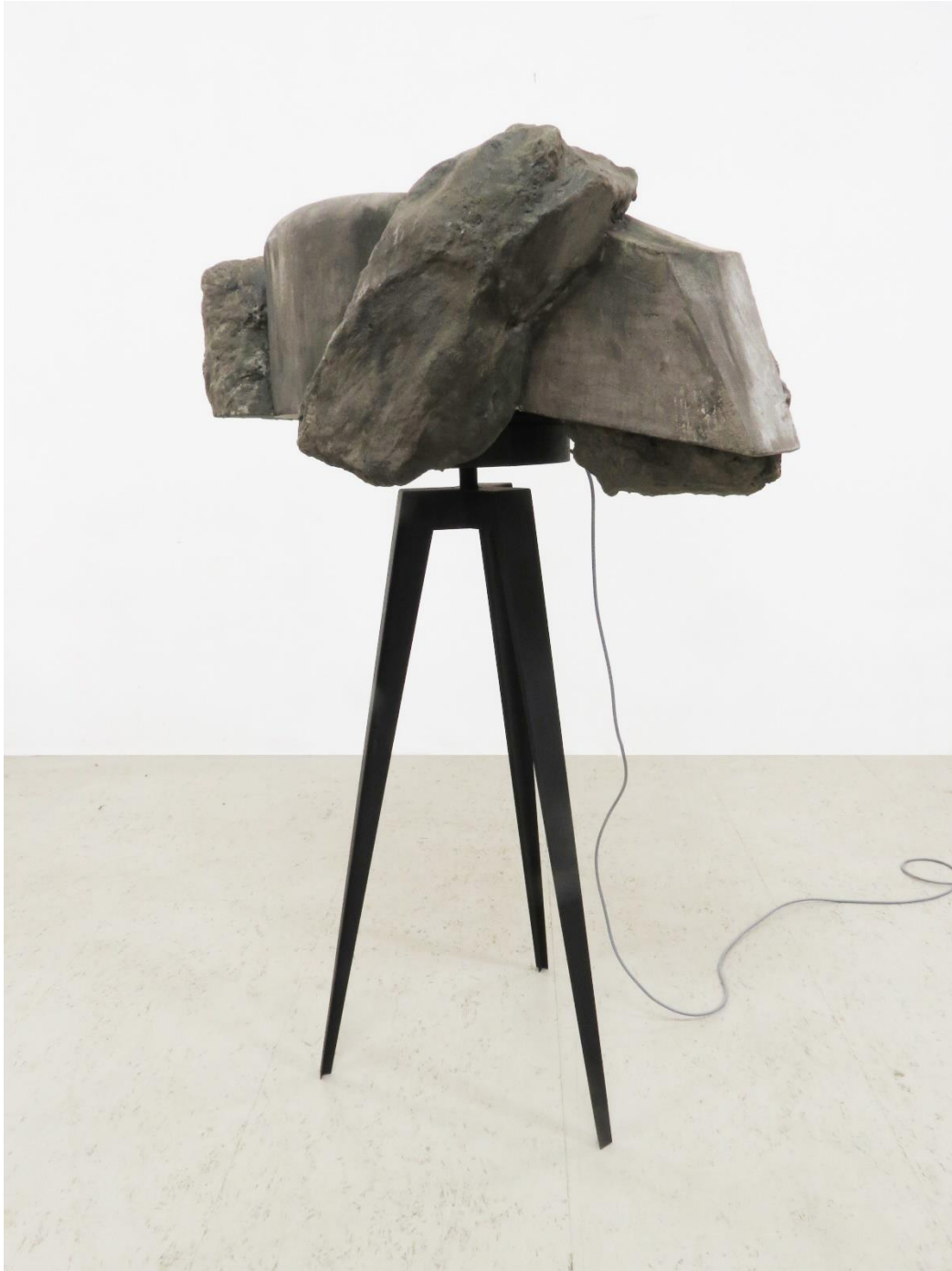
Crossfade, 2015, 80 x 60 x 150 cm steel, wood, PU, acrylic resin, cement, paint, turning table