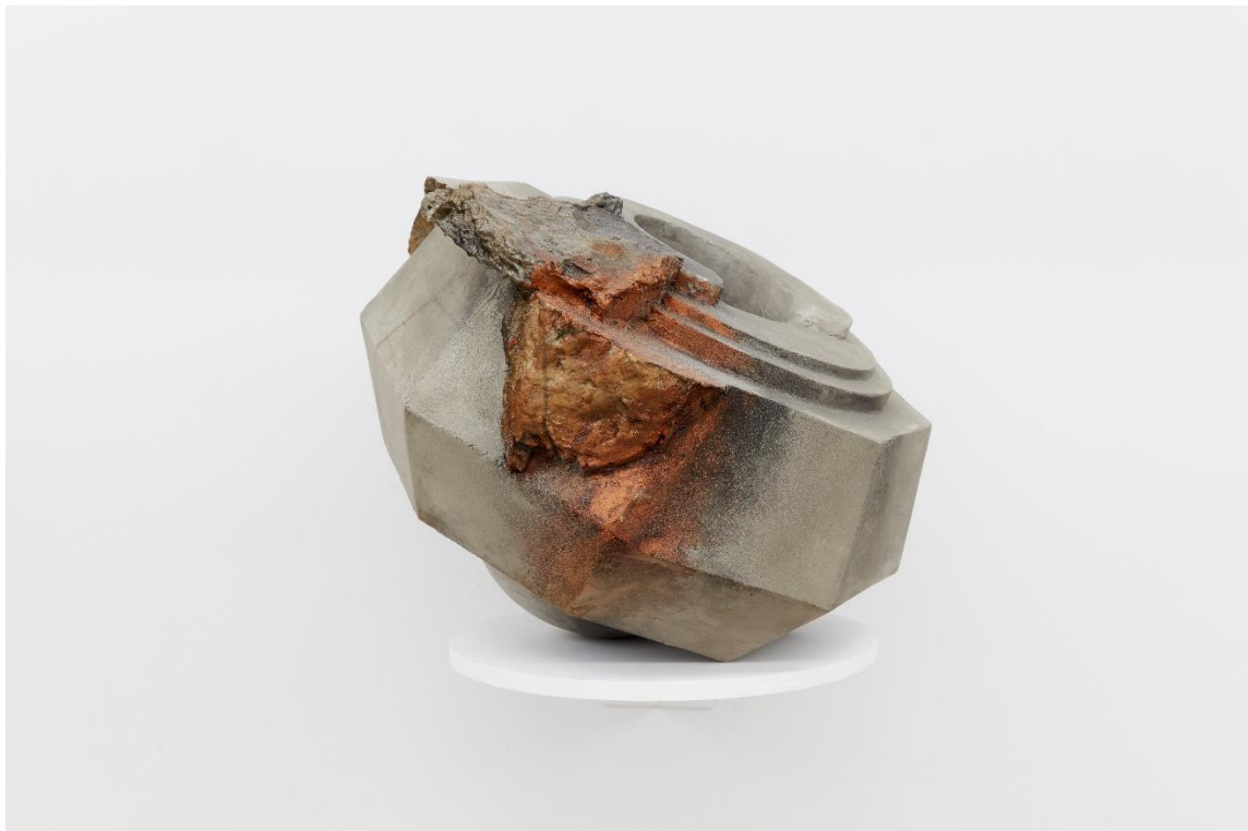
Orbit, 2022, 55 x 55 x 40 cm wood, PU, acrylic resin, epoxy, cement, iron powder, paint